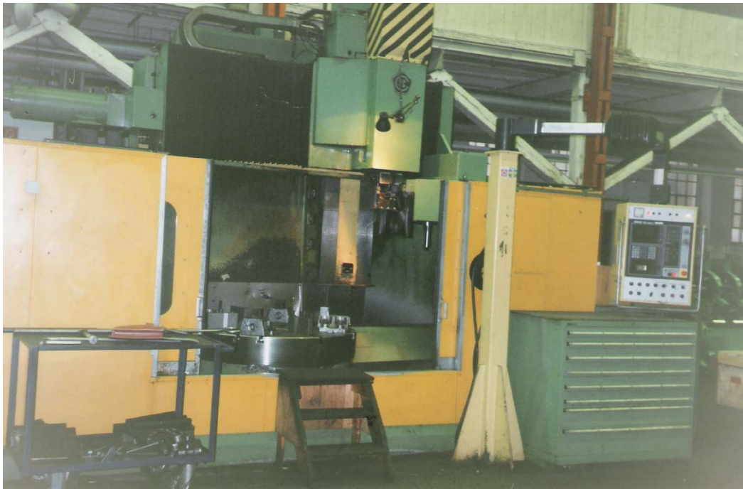
Krasnodar_1A516_003 (Front View)

Technical Details without engagement, subject to prior sale. Machinery, Tooling and Equipment remain property of Five Star Machinery Pty. Ltd. until final payment has been made. Used machinery, tooling and equipment is sold as inspected or offered without inspection, with no warranty unless other written arrangements have been made. Non visible or hidden flaws are not accountable by Five Star Machinery Pty. Ltd.