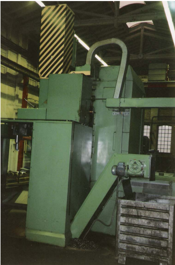
Krasnodar_1A516_001 (Side View)