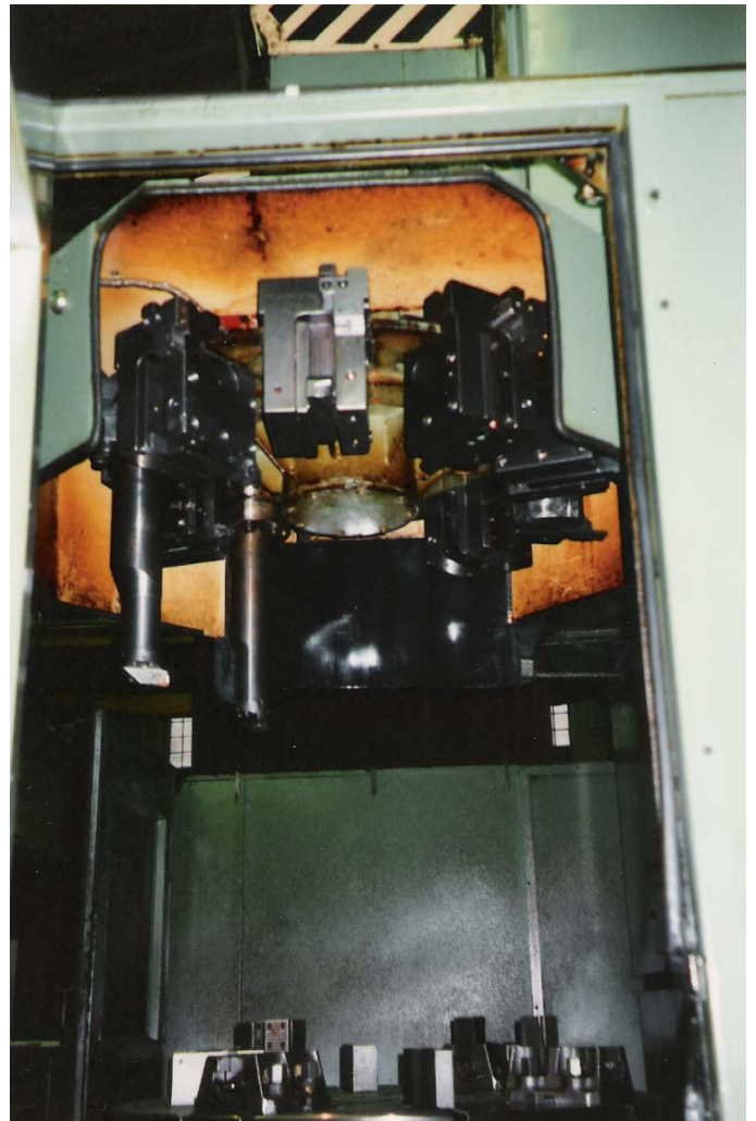
Krasnodar_1A516_002 (Tool magazine)